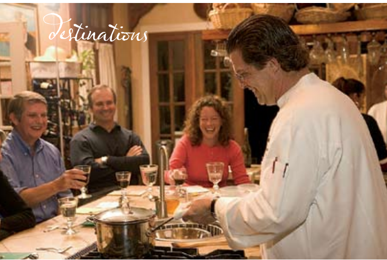
Creole with a dash of Cajun grounds the culinary curriculum at the New Orleans Cooking Experience. Opposite: The House on Bayou Road.